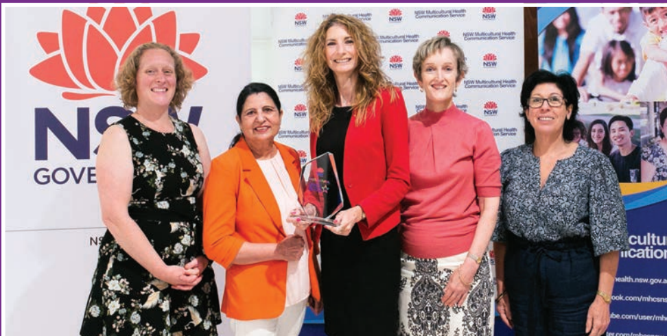
Members of the Strategic Communications & Media and Multicultural Services teams accepted the award on behalf of the District