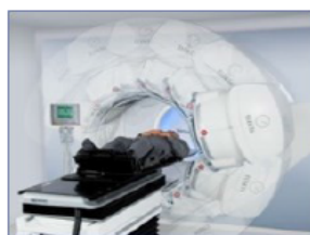
Figure 1: Linear accelerators are used to deliver radiotherapy