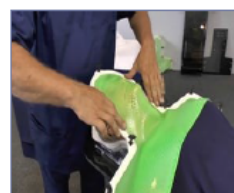
Figure 4: Mask moulded to the patient