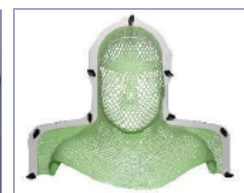
Figure 5: Mask ready for treatment