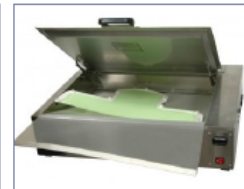
Figure 3: Mask heated in a water bath