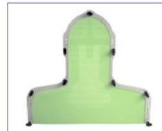
Figure 2: Unmoulded thermoplastic mask