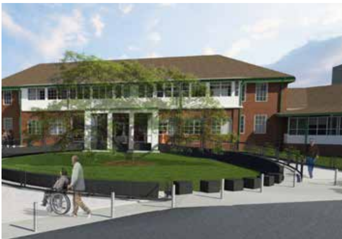
Artist's impression of the new OC opening in 2025.

The redevelopment team, as well as our project partners in project management and construction, are laser focused on bringing the vision for a contemporary centralised allied health hub to life for the people of the Southern Highlands community.