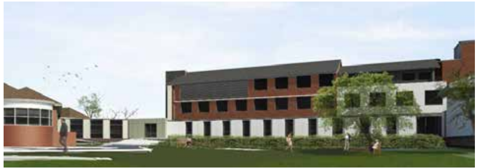
Artist's impression of the new General Services Building.