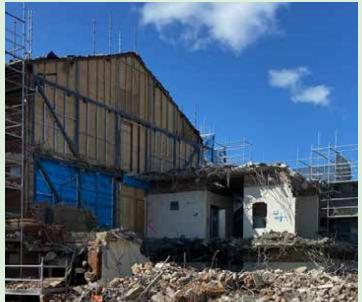
Before and after photos show the precision demolition.