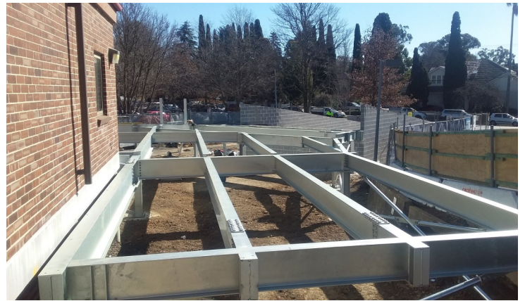
NEW Ambulance Ramp under construction