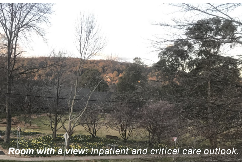
Room with a view: Inpatient and critical care outlook.