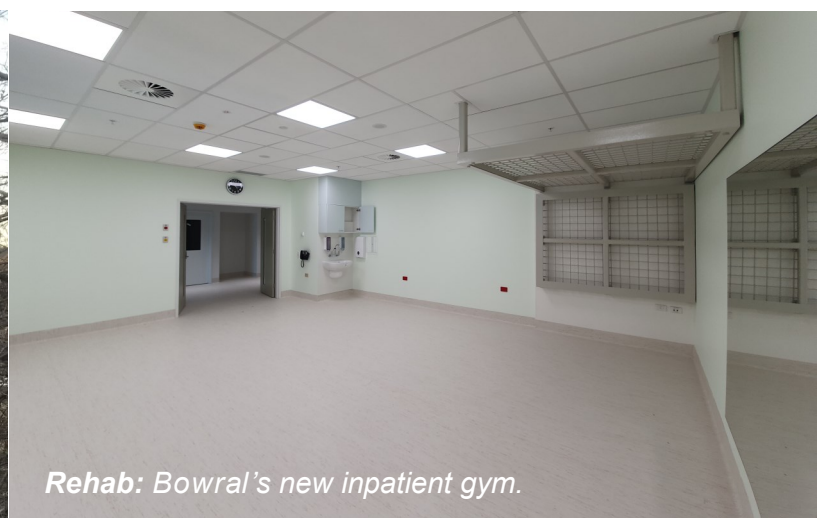
Rehab: Bowral's new inpatient gym.