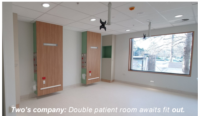
Two's company: Double patient room awaits fit out.