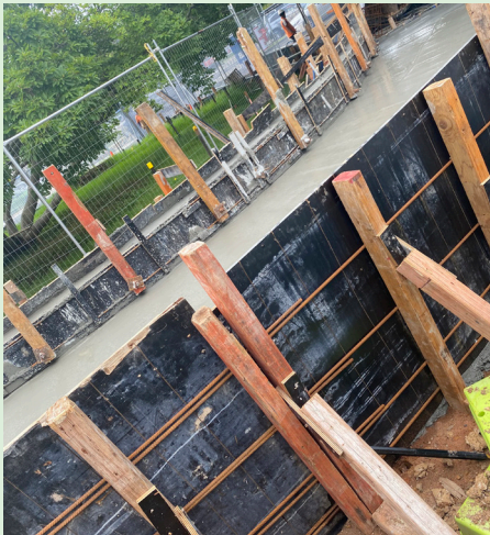
The first concrete pour has been completed for the ramped access to The OC