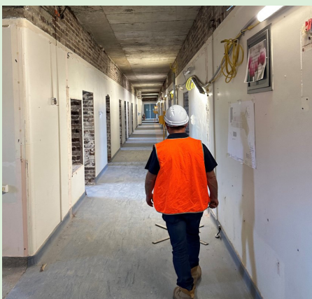
The former hospital building, Milton Park is looking very different on the inside!