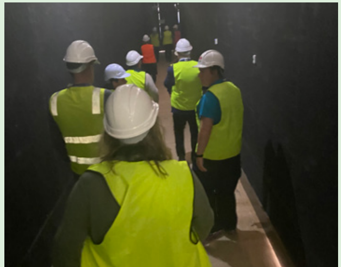
Working with the Hotel Services and Redevelopment teams to ensure their trolleys and tugs can be safely used in the new linkway.