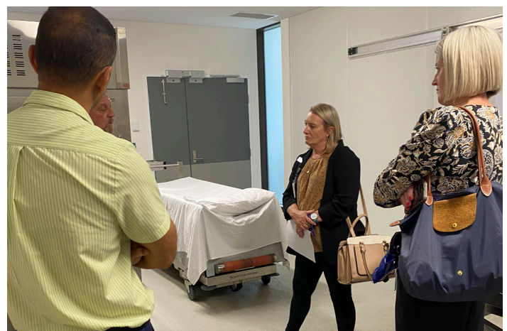
The team viewing the mortuary equipment and space at Campbelltown Hospital.