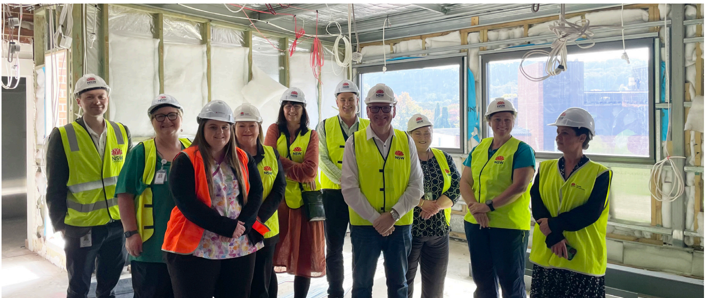
Bowral & District Hospital leadership team in the operating theatres area of the former Milton Park building.

Bowral & District Hospital's leadership team recently toured the works underway in the former Milton Park building. The team from Donnelley Constructions is transforming what was once the main hospital building into a contemporary General Services Building (GSB), housing the broad range of teams that support the day-to-day operations of a busy regional hospital.