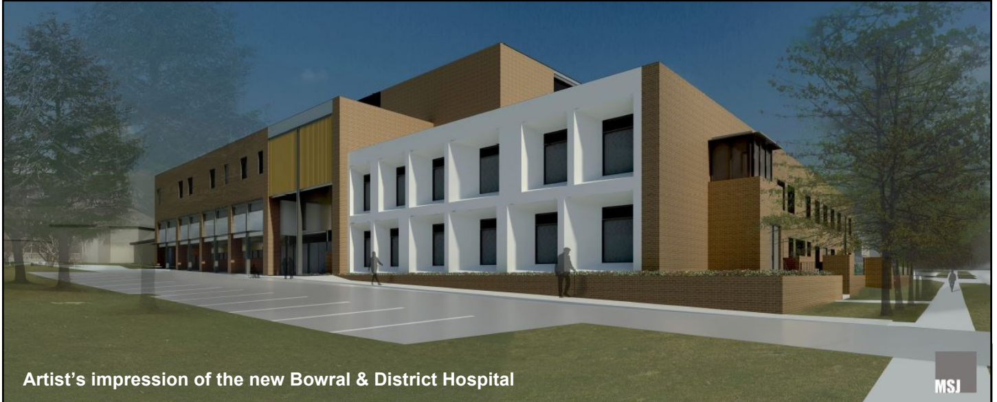
Artist's impression of the new Bowral & District Hospital