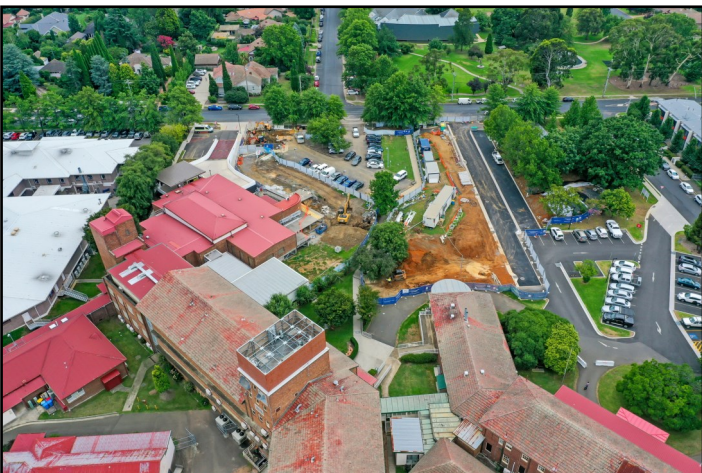
Aerial photo of the hospital in February 2019.

The total concrete volume will be equal to 1.6 Olympic-sized swimming pools and the length of mechanical and medical gas pipework would reach almost twice the height of Australia's highest mountain, Mt Kosciuszko.