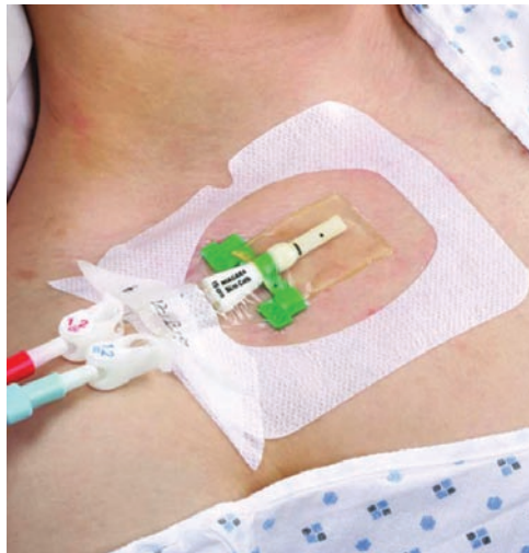
Irrespective of the access point, effective dressings and good process, as above, will stop infections.

appropriate may be a midline, a peripherally inserted central catheter (PICC) or a central venous catheter (CVC) – there are choices that need to be made through proper patient and vascular device assessment.