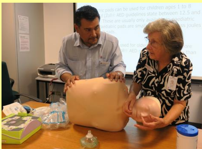
Hospital tours with groups from Parents' Café Fairfield and

This month the Fairfield Consumer & Community Participation Network received basic CPR training as part of their monthly meeting on top of discussing a variety of issues relevant to the hospital including the upcoming refurbishment and recent local media coverage.