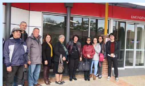
Tour groups from Villawood Public School (above) & Navitas Cabramatta (left).