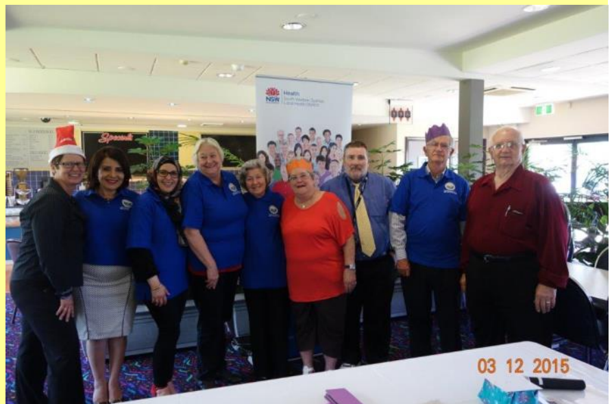
Fairfield Network at the Christmas Function

The first meeting for 2016 will take place on Friday 26 February 2016.