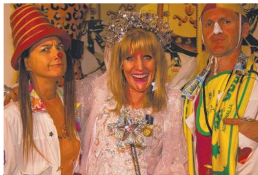
Humpty Dumpty Foundation ambassador Fairy Sparkle and the Clown Doctors at the Humpty Dumpty Foundation Great Ball.

The Humpty Dumpty Ball has been running annually since 1990 with money raised to purchase over 34 pieces of medical equipment for 21 hospitals around the country,