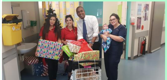
Mind Champs Early Learning Centre - Lane Cove